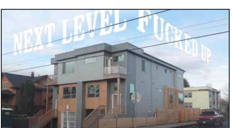
Still from Next Level Fucked Up, Experiment 15

Breathing Light, the films of Vanessa Renwick, virtual artist in residence. Ground yourself on the wide open dirt, wrap yourself in an electric quilt, and float through dreamtime travels and seasonal migrations, blossoming outward, into this world that we try to pin down in time, yet, we breathe light. Remember, we breathe light, and stardust is what we shine.