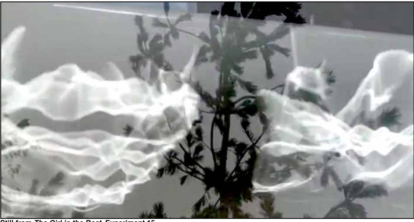
Still from The Girl in the Boat, Experiment 15