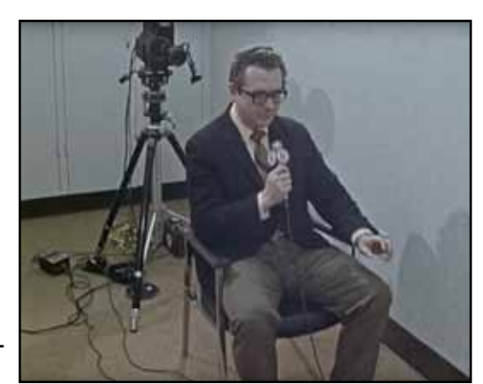
Still from The Stars of Texas Shine Tonight , Experiment 4

Ghosts of Lost Futures is a program of video works by 10 artists commissioned by the G. William Jones Film and Video Collection and was curated by Mike Morris. Each artist was given access to the same cache of footage from the WFAA Newsfilm Collection shot in Dallas, Texas in the year 1970, the year of the archive's founding. The program was intended to celebrate the 50th Anniversary of the archive, but due to the COVID-19 pandemic and the resulting lockdowns, the program was not completed until the Spring of 2021. The artists were given complete freedom in how they re-interpreted the footage and its historical context. The resulting works are profound meditations on mourning, melancholy, disaster, and various reinterpretations of the events of 2020 and 2021 through images of Dallas' past. This is a selection from the 10 completed works.