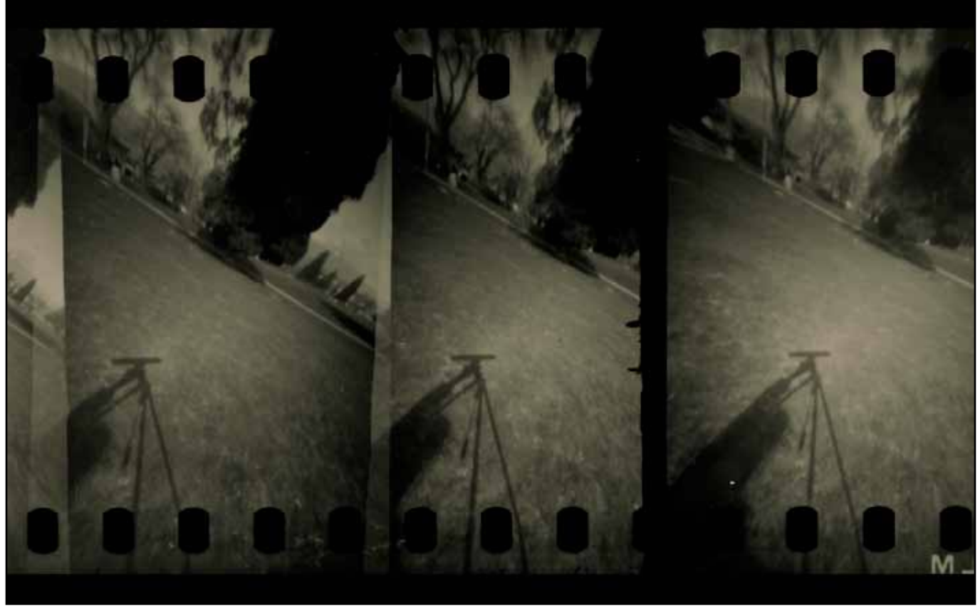
Still from Pinhole Park, Experiment 10

Floral Yearnings , Linda Fenstermaker, 3:40, 2021, USA. A very soothing, simple and graceful ode to the dahlia. The looping, musical soundtrack with voice, breathe and flute added to and enhanced the meditative quality of this short film.