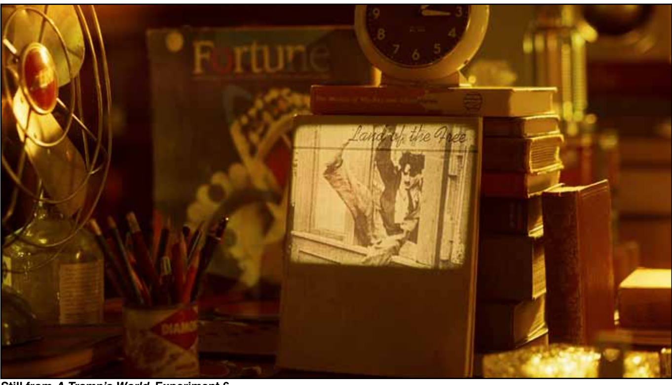
Still from A Tramp's World, Experiment 6

Protest Etiquette , Adán De La Garza, 1:07, 2020, USA. Protest Etiquette is a response to the "centrist" cry for civility. This cry shifts its criticism to the behaviors of those protesting injustice, instead of the actual injustices. It sidesteps any real momentum for the sake of not appearing rude.